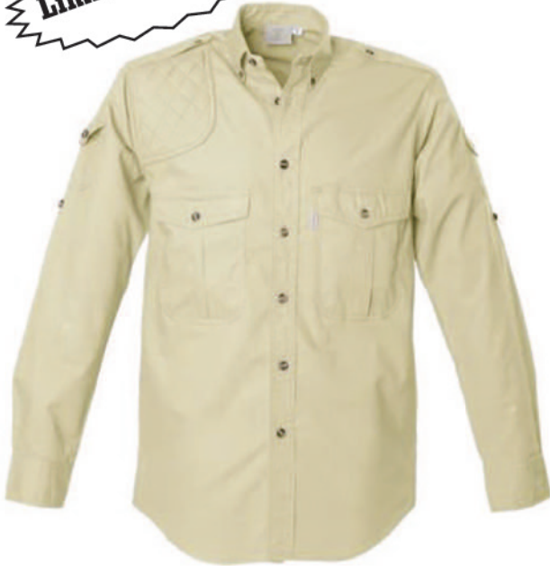
TAG@Safari Long Sleeve Shooter Shirt for mem.

Shooter Shirt for men in long sleeves, with shooting patch and shoulder epaulettes, is an authentic African big game safari shirt inspired by great hunters such as Courtney Selous. The diamond quilted shooter patch effectively cushions gun recoil. Two pleated chest pockets with button down flaps carry essential hunting gear. Two smaller pockets with button down flaps on the sleeves hold ammo and other needed supplies. Functional cross-stitched epaulettes prevent a gun sling or binoculars from slipping off your shoulder. Button down collars stop shirt collar points from striking your face when hunting on windy days. Double stitched throughout for durability, with generous sizing and long tails that stay tucked in. Made in Africa from rugged, lightweight 5 1/2 ounce cotton for cool comfort. This men's short sleeved shooting shirt was made for your ultimate safari experience